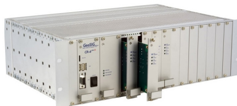
CR-6plus central recorder