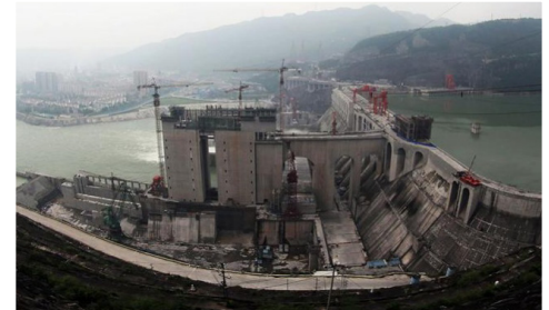
The Xiangjiaba Dam, photo courtesy Xinhua News Agency.

Another Solution using GeoSIG instruments and a capable Partner demonstrating that quality and reliability can also be cost effective.