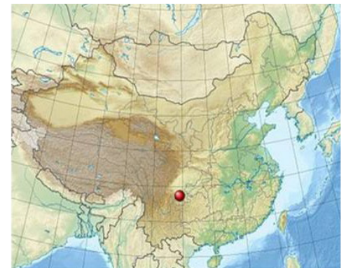
The Xiangjiaba Dam is located on the Jinsha River – a tributary of the Yangtze River in Yunnan Province and Sichuan Province, southwest China.