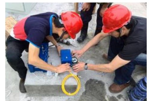
Installation of GMSplus and a triaxial force balance AC-73 accelerometer.